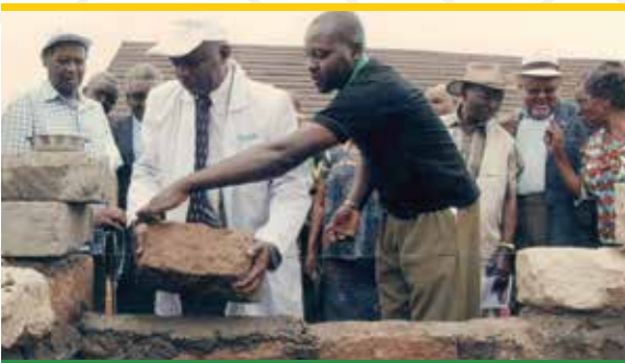
Laying of the foundation stone