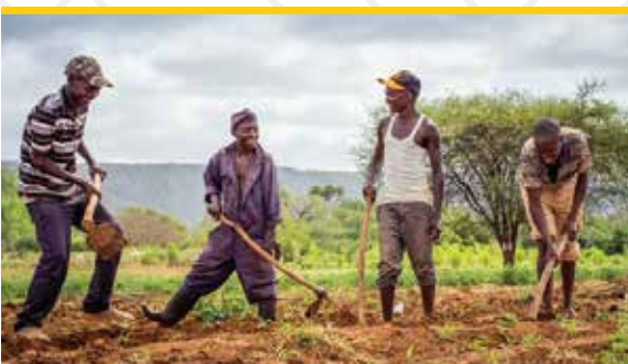
Impacting our community through employment opportunities