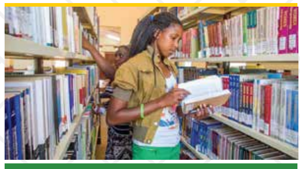
Students at the university library