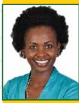
Hon. Senator Sylvia Mueni Kasanga