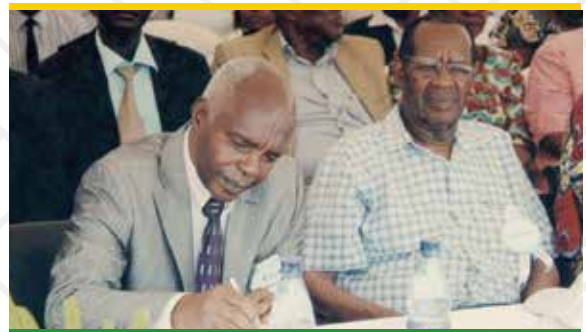
Late Chairman and Makueni Governor 2014