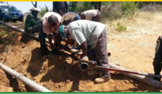
Laying of the first pipeline 2013 August