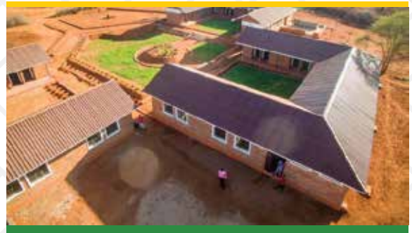
Men's Hostel 2015