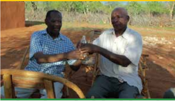
The late Chairman and his friend blessing the site