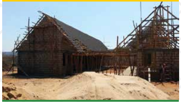
Construction of the admin block Nov 2013