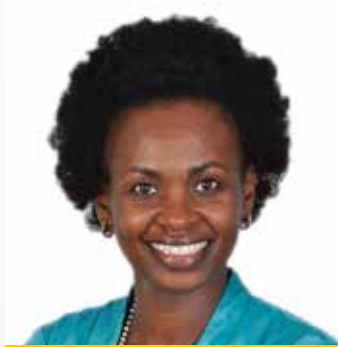
Hon Sylvia Mueni Kasanga